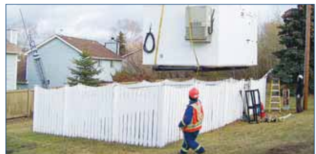
In with the new!