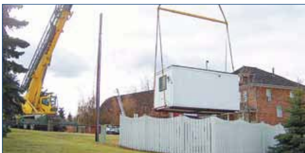
Out with the old...

Since 1979, the SIA has operated an ambient air quality monitoring network to measure concentrations of substances associated with heavy industry. Station audits revealed that the Sherwood Park station roof was beginning to breakdown. The station, located at the Ottewell Barn, was replaced in October after being in service for 27 years.